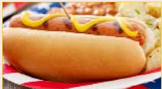
GOODIES – Donations of hot dogs, hamburgers and other products needed for the Santiago Festival.