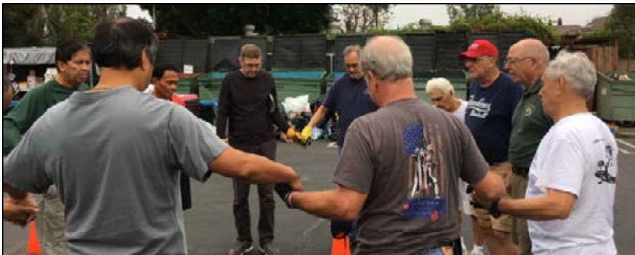
UNITED IN PRAYER – Volunteer Brother Knights clasp hands before a recent second Saturday recycling day.